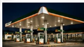
PREMIUM BRANDING & CANOPY