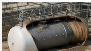
SAFE & RELIABLE INFRASTRUCTURE