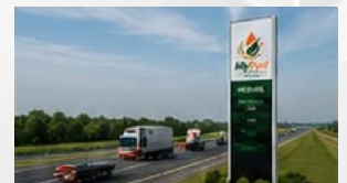
STRATEGIC HIGHWAY LOCATIONS