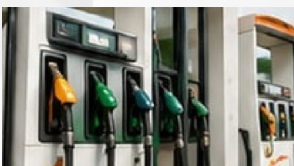
ADVANCED DISPENSING TECHNOLOGY